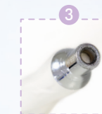
MICRODERMABRASION with Diamond grains [for scars and stretch marks too!]

The diamond-grain handpiece is a new device to treat the most critical areas, like the T-zone, in a selective and delicate manner, while at the same time reducing the appearance of scars and stretch marks by penetrating deep.