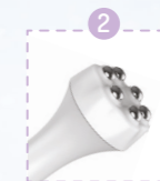
EXTRA-EFFECTIVE TREATMENTS with mesoporation