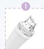
DEEP CLEANSING thanks to the water-based peel [aspirating/infuser handpiece]

By making the most out of the transdermic delivery of the mesoporatic handpiece, your skin is restructured by the Hyaluronic Acid and Dermakléb serums.